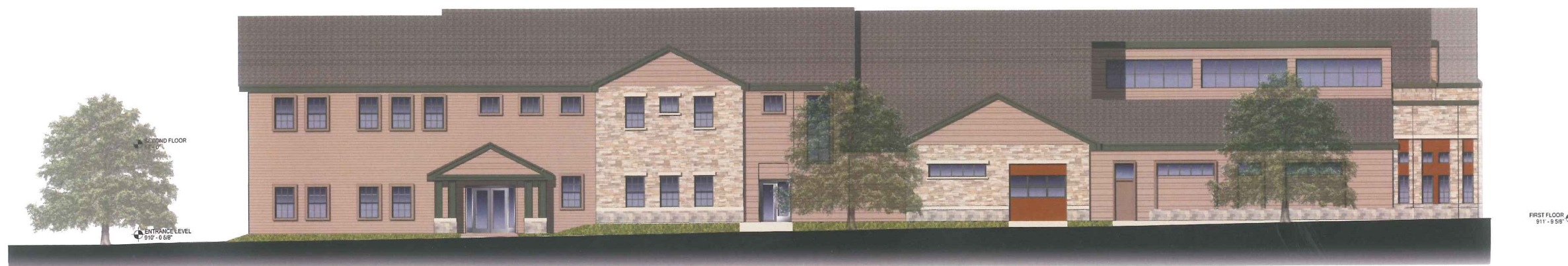
3 EXTERIOR ELEVATION - SOUTH SCALE: 1/8" = 1'-0"