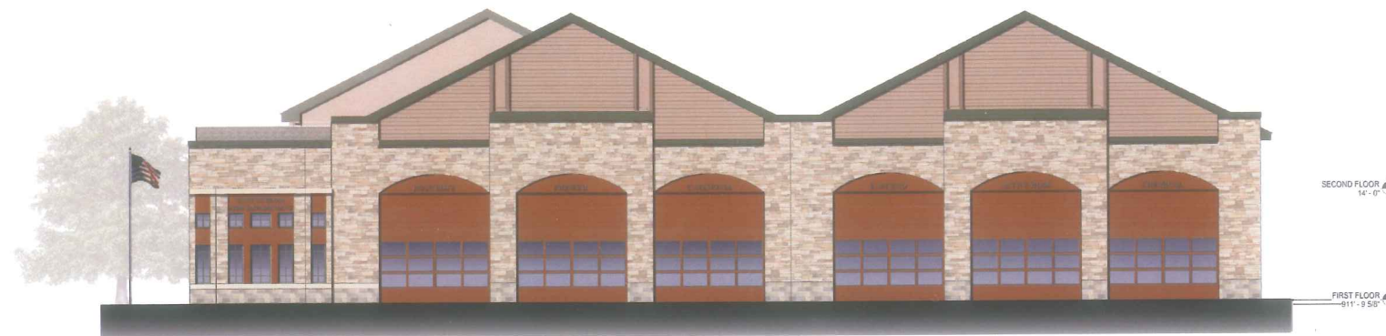
4 EXTERIOR ELEVATION - EAST SCALE: 1/8" = 1'-0"