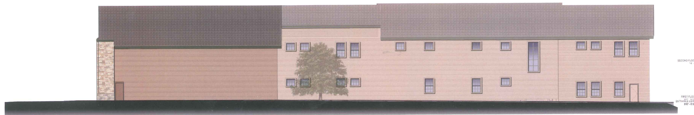
1 EXTERIOR ELEVATION - NORTH SCALE: 1/8" = 1'-0"